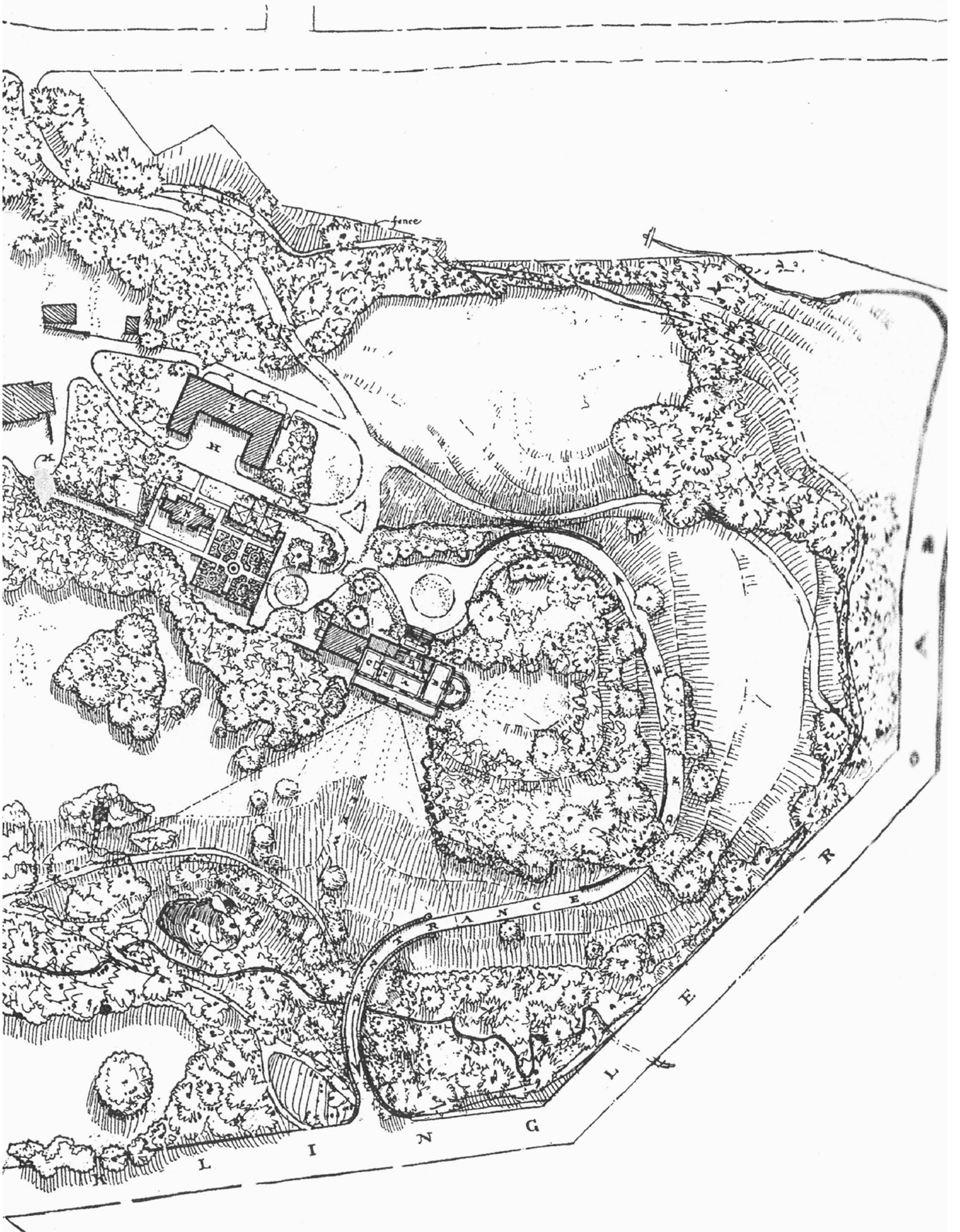
The Sketch Plan of Property Discloses Story in Graphic Form - Entering from Kling Road, the visitor crosses the bridges and ascends the drive way to the house. The drawing shows the position of the garden, garage, cottage and general lay of the land.

Samuel Howe. American Country Houses of To-Day . New York: Architectural Book Publishing, 1915.